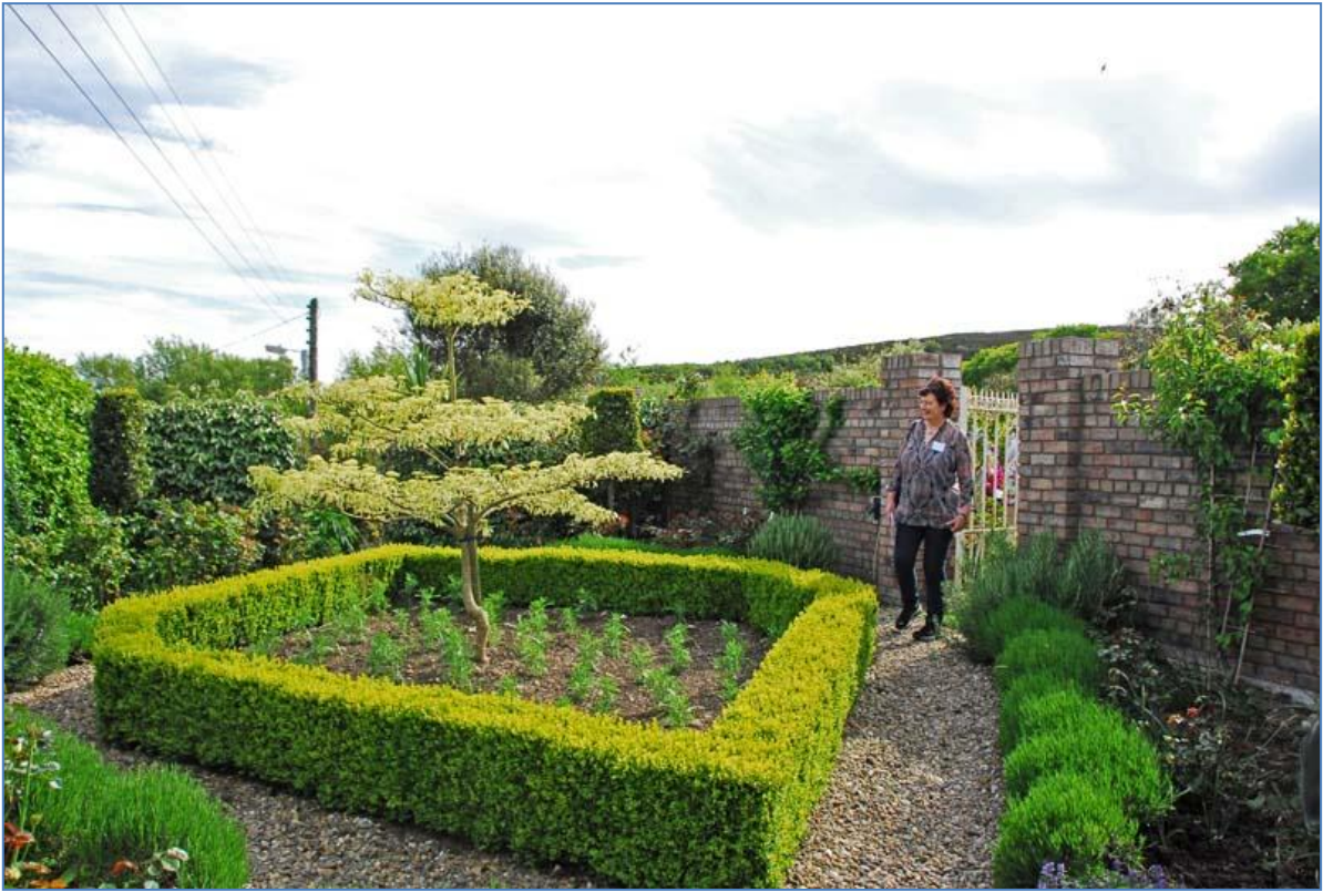
And the view from the seat was very pleasant.