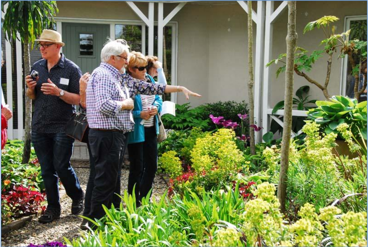
Enjoying the planting at the front of the house. There was much to admire and, as you can see, the weather was perfect for our visit.