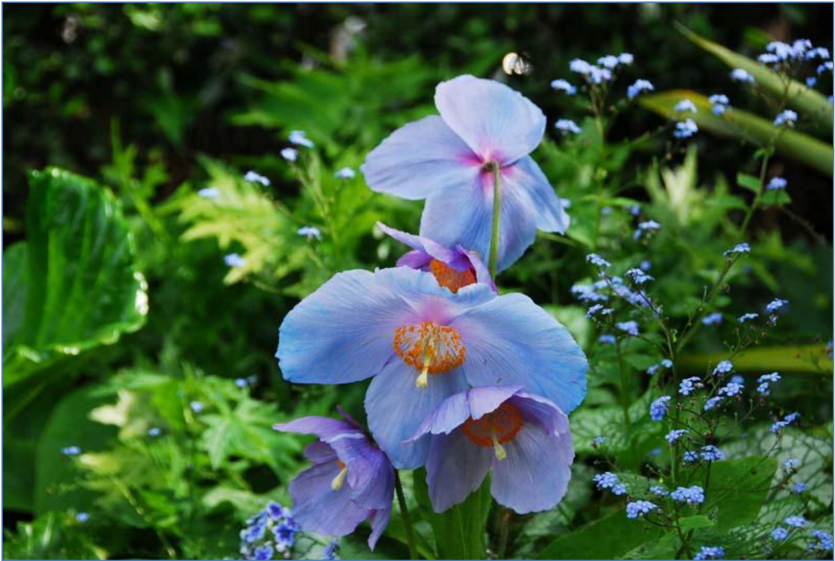
All eyes were drawn to the beautiful meconopsis in the pond area.