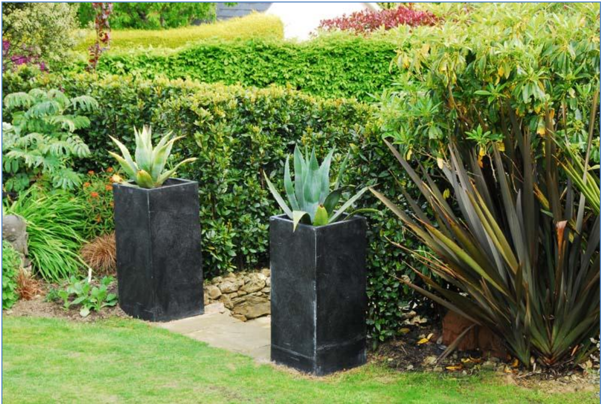
A good way to mark an entrance!