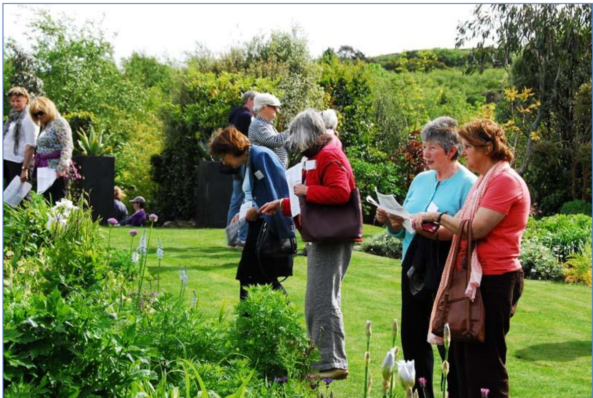
There was much to admire there.