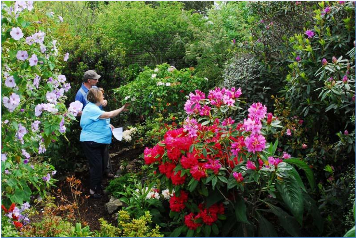
The contour of the ground created a small glen in this area and it was perfectly planted with a range of rhododendrons.