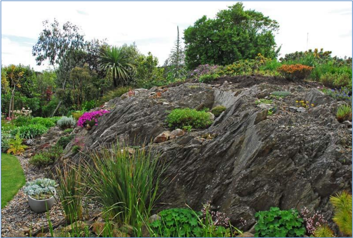
In Howth, rock is never far from the surface and provides wonderful opportunities for interesting planting.