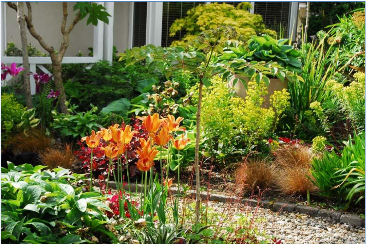
Many people commented on the colour combination of the tulips and the euphorbia.