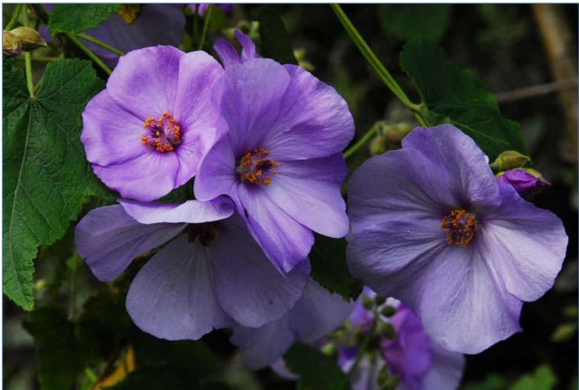
And, finally, an attractively colour abutilon to finish our garden walk.