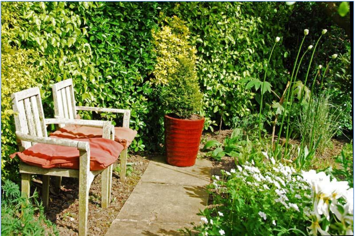
I think gardeners rarely use the seats they place in the garden but they are appreciated by visitors.