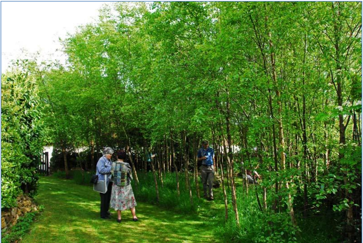
Despite the small size of the garden there was still room for a small copse.