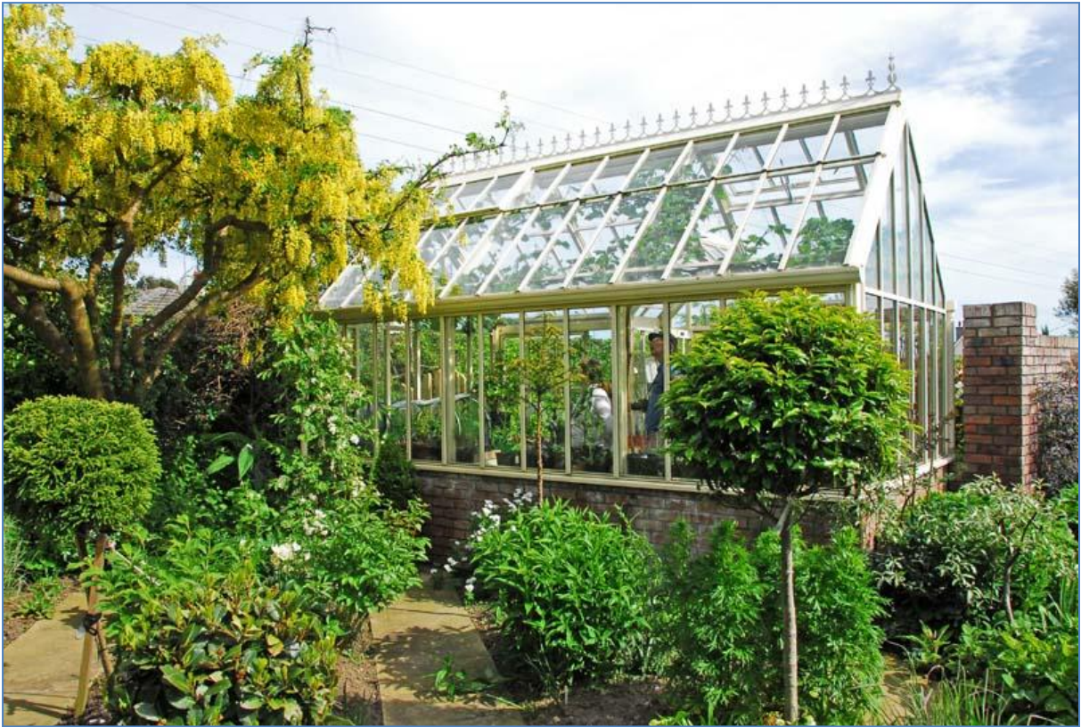
The glasshouse was used mainly for growing vegetable and raising plants for the garden.