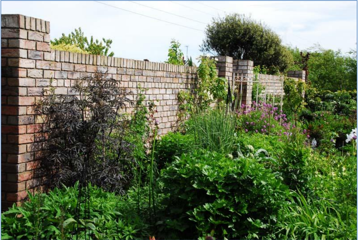
This was the main border in the garden and was planted with a mixture of herbaceous perennials with some shrubs to give substance.