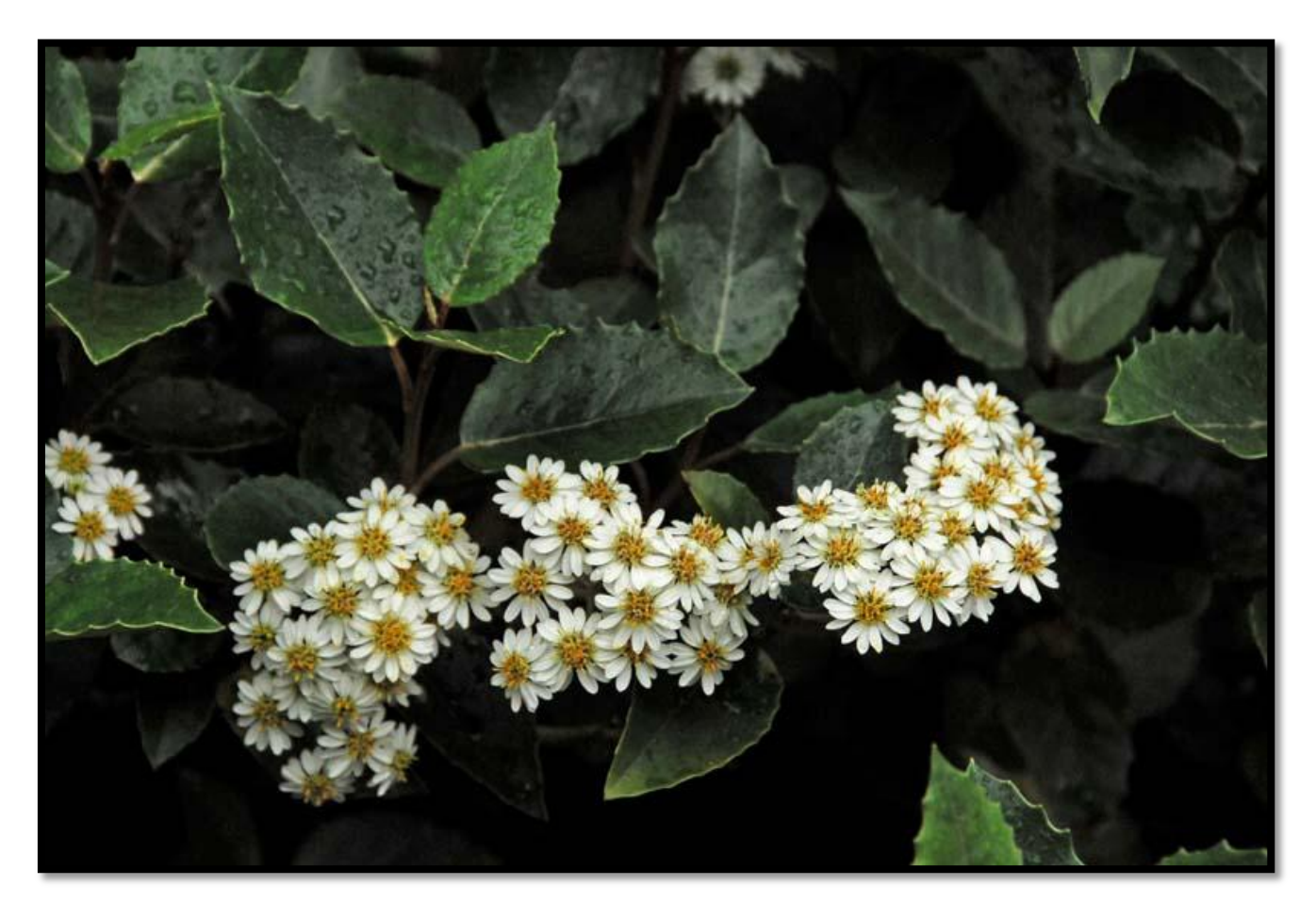
There has always been an excellent collection of Olearias at Malahide and this Olearia arborescens made a spectacular show.