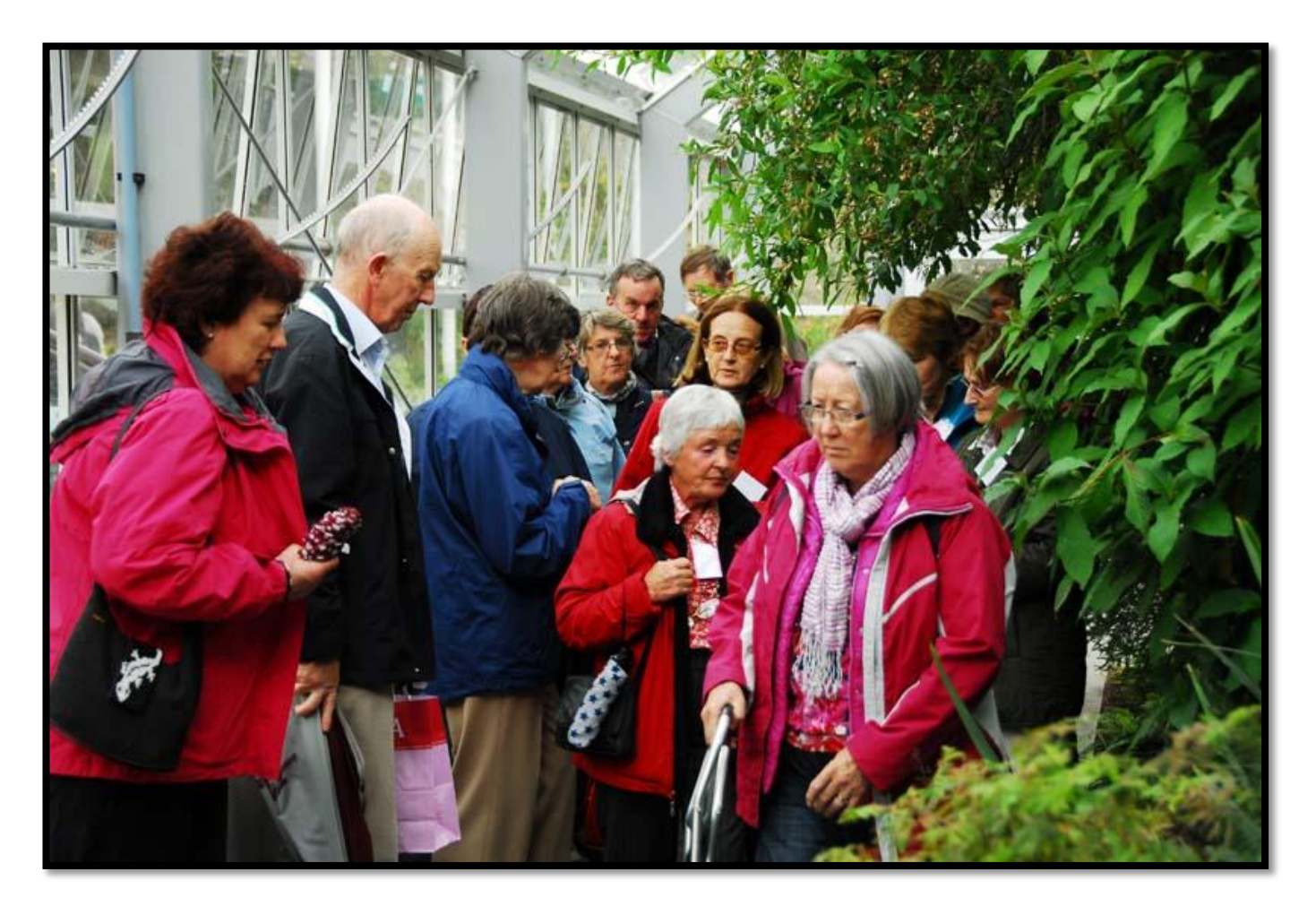
Around the glasshouse and some of the plants in the following photographs.