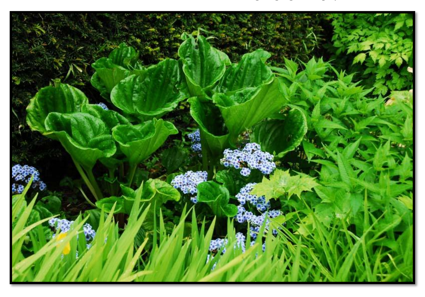
Myosotidium hortense, the Chatham Island Forget-me-not obviously enjoying conditions in the garden