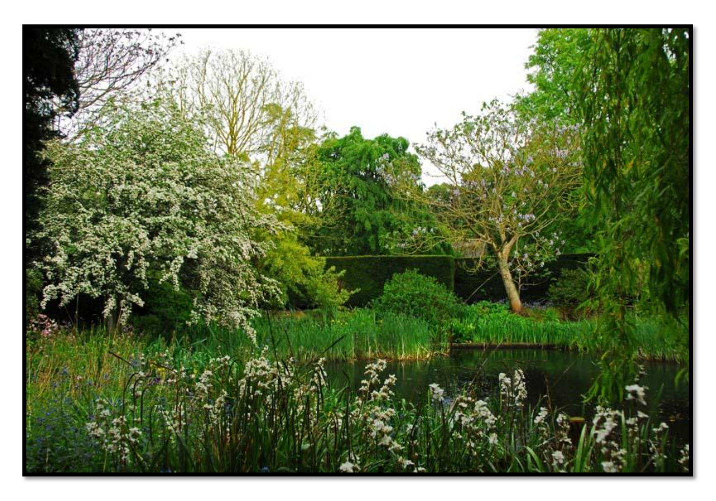
Looking across the pond – Libertia in the forground, Crataegus(Hawthorn)on the left and...