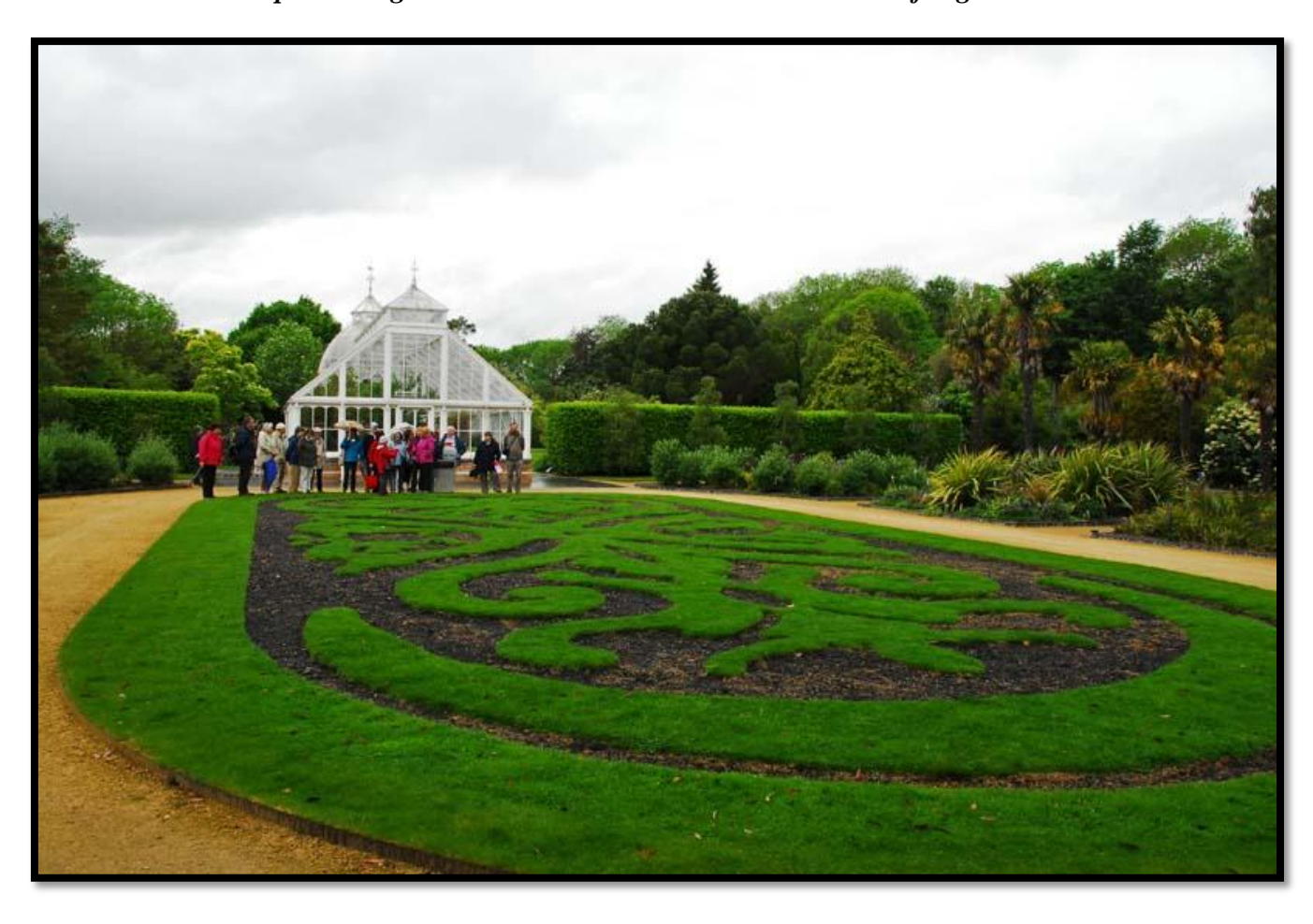
And, I'll finish with this view of the lawn in front of the glasshouse and hope I have shown enough to tempt you to visit Malahide. I have only shown a little of the gardens and there is far more to see.