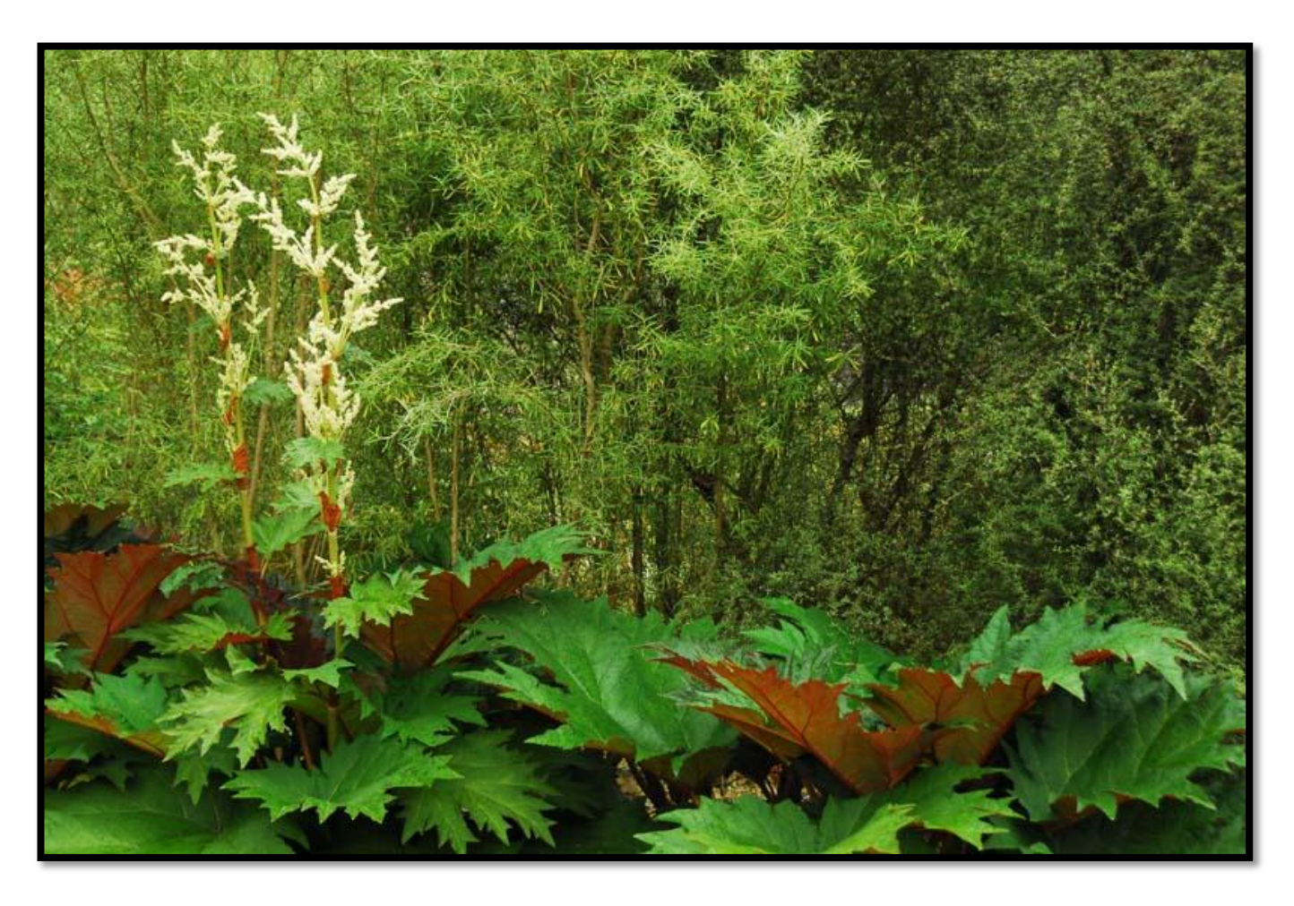
An excellent stand of Rheum palmatum