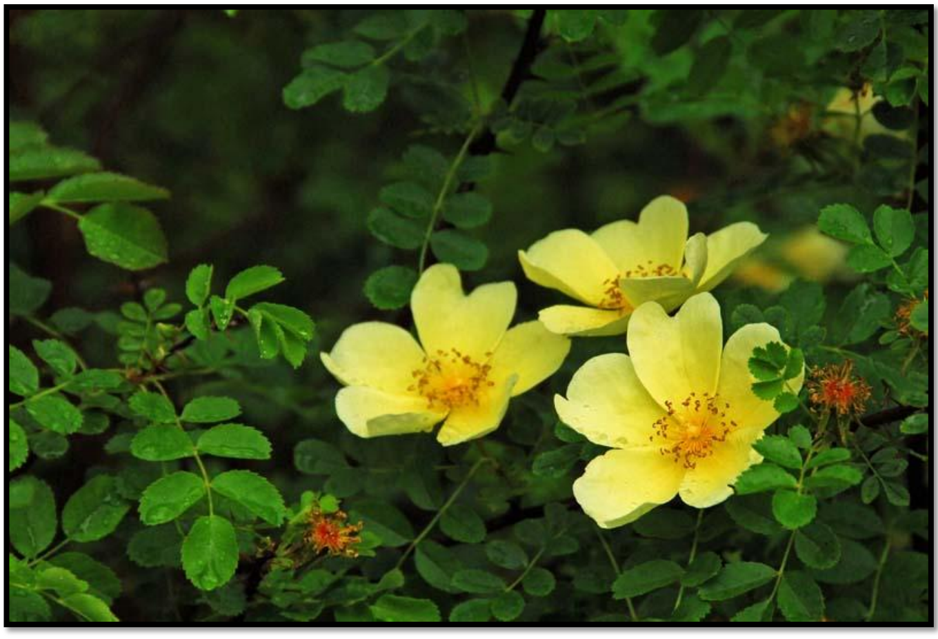
Rosa 'Canary Bird'