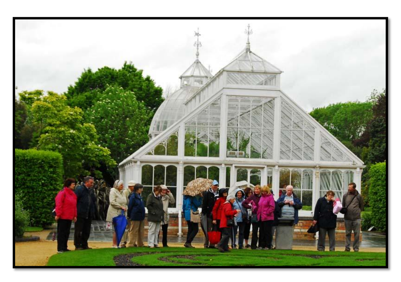
Despite the light rain the walk continued to this wonderful glasshouse.