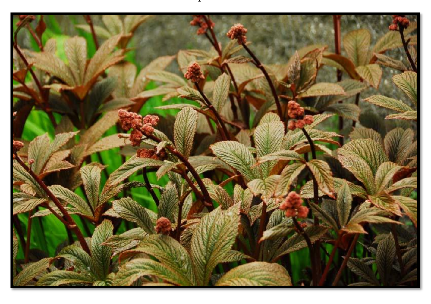
Rodgersias enjoyed the moist conditions at the side of the pond.