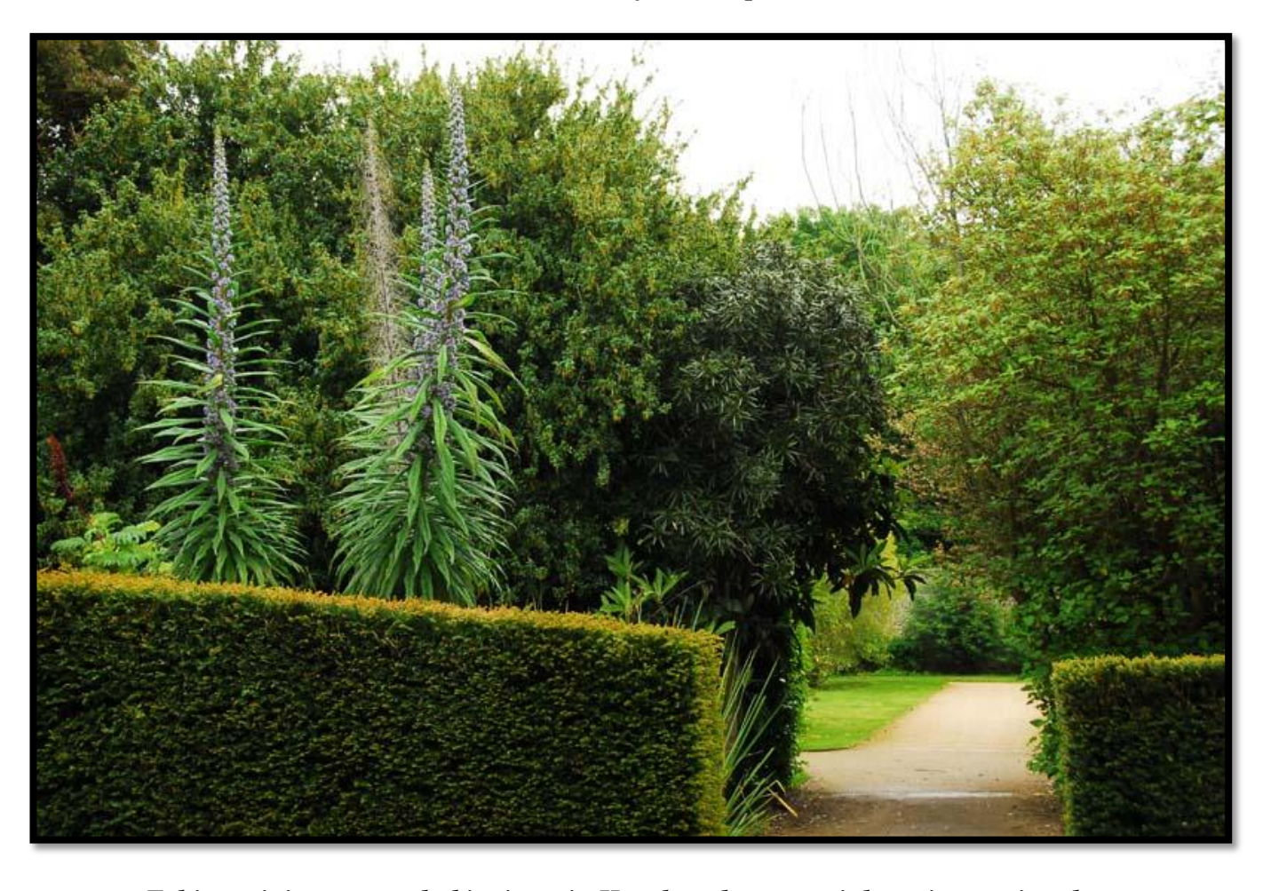
Echium piniana seemed ubiquitous in Howth and are certainly an impressive plant.