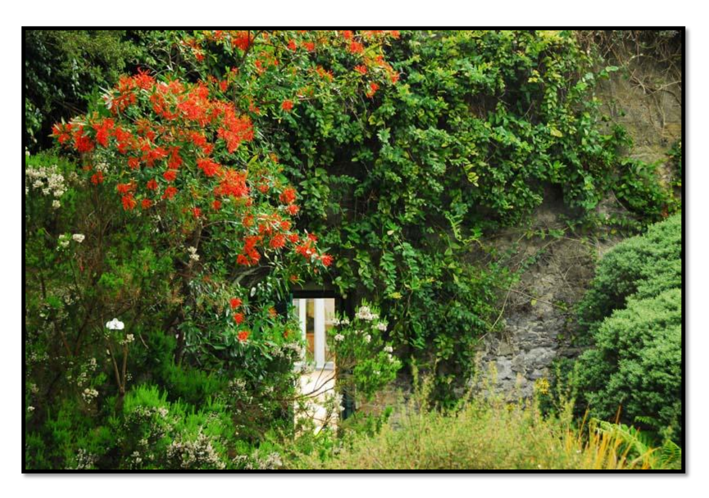
A mature Embothrium coccineum (Chilean Flame Tree) in the Chicken Yard